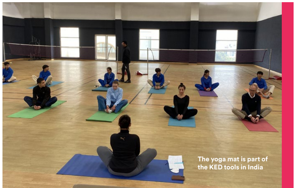
The yoga mat is part of the KED tools in India