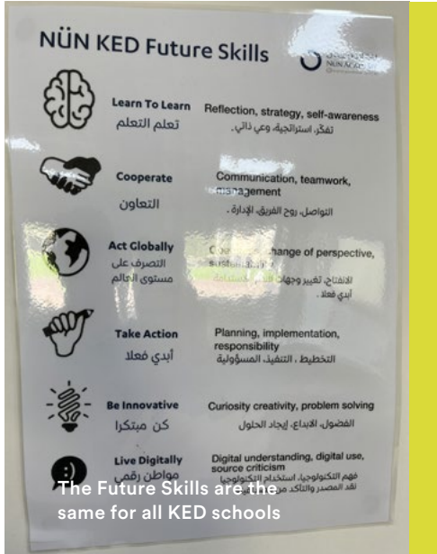
The Future Skills are the same for all KED schools