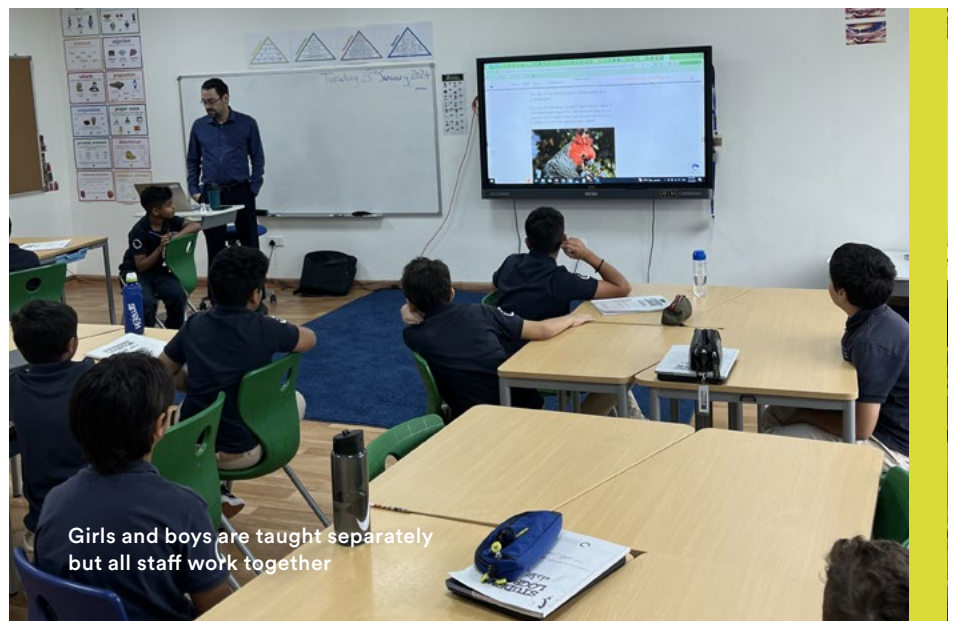
Girls and boys are taught separately but all staff work together

The school day started with a session outside, where we listened to the national anthem before heading to the classrooms. Base groups have their own classroom for start and end of the day, but lessons are held in different rooms depending on the subject, just like in Sweden. During base group sessions, students plan their day. There is no workshop yet, but many lessons