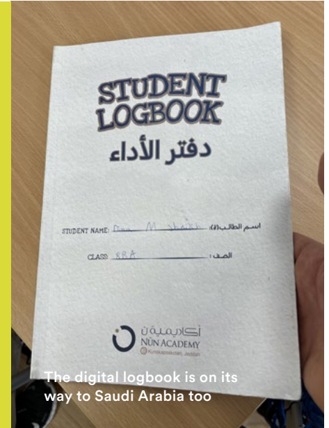
The digital logbook is on its way to Saudi Arabia too

Nün Academy follows the Cambridge curriculum and uses books rather than a Learning Portal. Their three core subjects are Arabic, English and Math. English is considered a first language like Arabic; most students are fluent in both and have far better English compared to Swedish students. There is a subject called Global Perspective, which handles e.g. why laws are important, what would happen if there are no laws and discussing them. In Sweden, this is covered in Social Science. Another subject at Nün is called Social and Emotional Learning, with content similar to Religious Education in Sweden. The school is divided into a girls and a boys section. Male teachers teach the boys and the females teach the girls. After the school day, all staff meet at the library in the girls section.