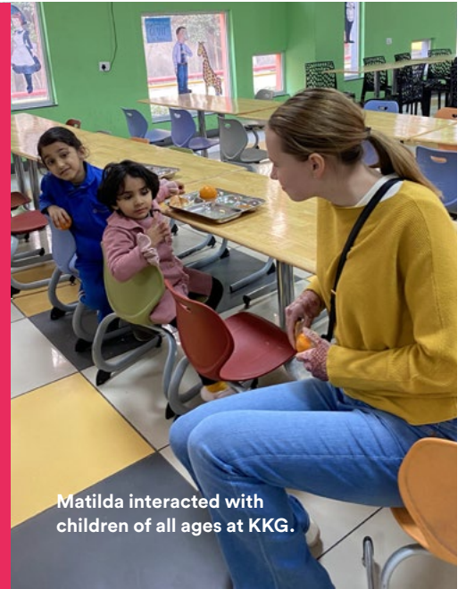
Matilda interacted with children of all ages at KKG.

governmental organization in Gurugram was a peerless example of such a cultural experience.