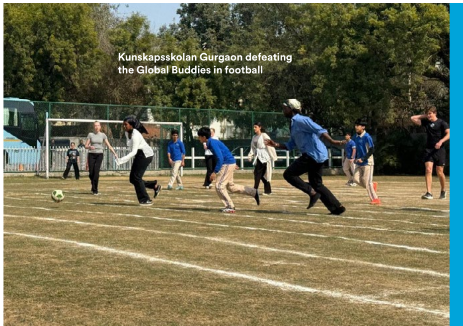
Kunskapsskolan Gurgaon defeating the Global Buddies in football

For starters, “they can play football”. Sweden lost. But more to the point, one student observed from her focus group interviews dealing with perspectives on happiness: