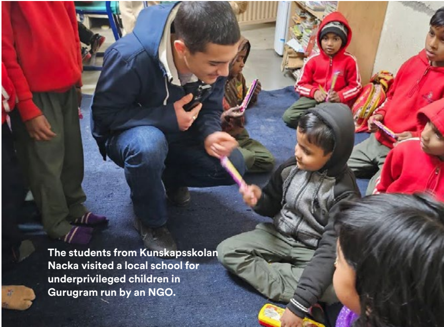
The students from Kunskapsskolan Nacka visited a local school for underprivileged children in Gurugram run by an NGO.