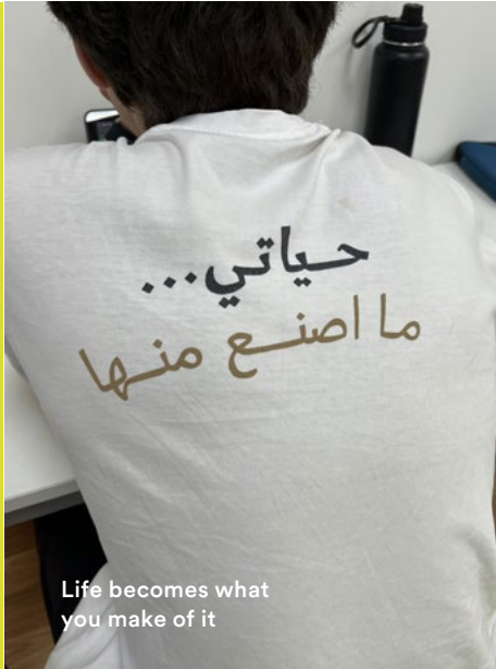
Life becomes what you make of it