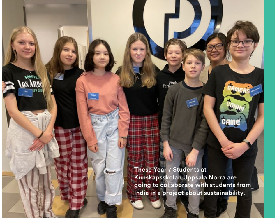
These Year 7 Students at Kunskapsskolan Uppsala Norra are going to collaborate with students from India in a project about sustainability.

And your school, Kunskapsskolan Uppsala Norra, is one of three schools in Sweden that are soon going to start a collaboration for students during base group time with students in India. The students are going to interact online in a project about sustainability.